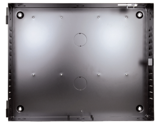
*ENCL2 with door off