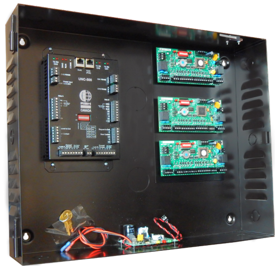
* AX-MNT-PLT mounted into ENCL2-PS shown with three x NURC-2002-B