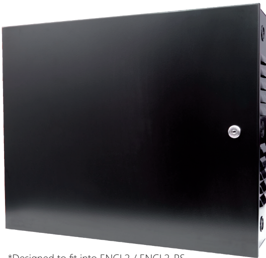
*Designed to fit into ENCL2 / ENCL2-PS