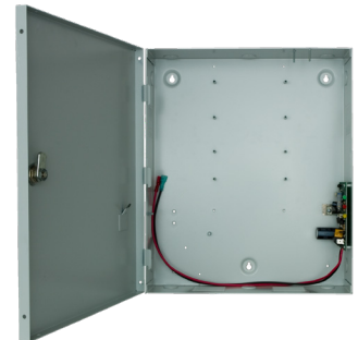
ENCL1-PS open door