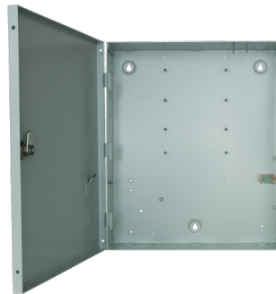
ENCL1 open door