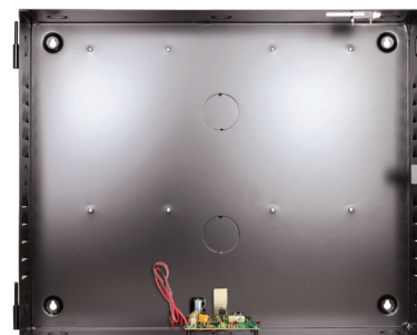
RBH-PS1224 shown Installed into open ENCL2